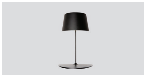
Illusion half black – Item no. 443

Design: Hareide Design Year: 2010 Types: Pendant lamp and wall lamp