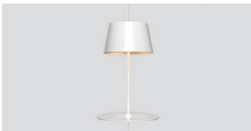
Illusion white – Item no. 440