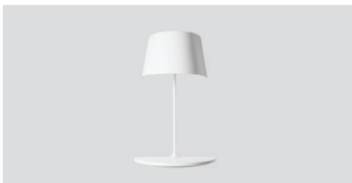
Illusion half white – Item no. 442