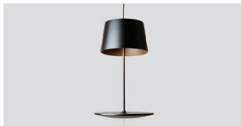
Illusion black – Item no. 441