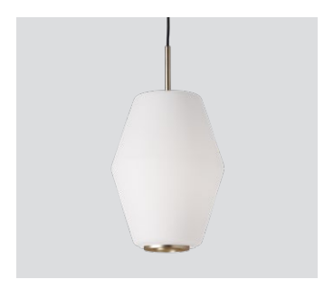
Dahl large brass matt – Item no. 445