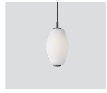
Dahl small dark grey - Item no. 492