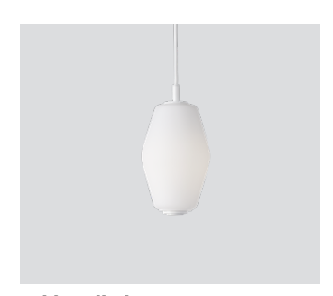
Dahl small white - Item no. 493