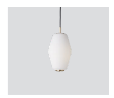
Dahl small brass matt - Item no. 491