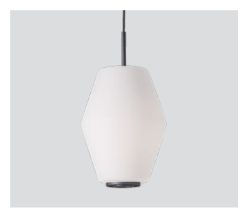
Dahl large dark grey – Item no. 446