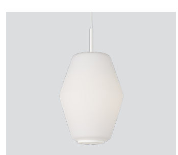
Dahl large white - Item no. 448